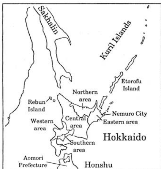
Fig. 1. Geographic map of the northern part of Japan (see Table 2, reproduced, with permission, from Infectious Agents Surveillance Report 1999).

Em18-ELISA in combination with Em2 plus -ELISA (Gottstein et al. 1993) or other assays using proteins in the same family (Lawton et al. 1997) for monitoring of prognosis. Anti-Em18 antibody becomes undetectable within one year after radical surgery of hepatic AE (Fujimoto et al. unpublished; Ishikawa et al. unpublished).