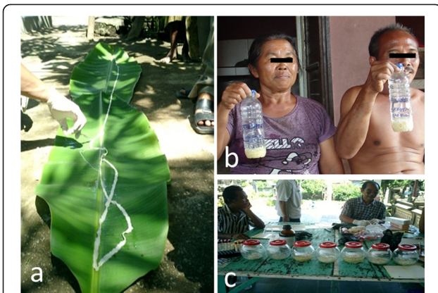
Figure 4 T. saginata (a, b, c) expelled after anamnesis and microscopy in Gianyar. One long T. saginata tapeworm expelled from one tapeworm carrier (a), T. saginata tapeworms expelled from wife and husband and kept in bottles (b), and T. saginata tapeworms expelled from 8 carriers during one day survey (c).

with T. solium cysticerci, with the remainder infected with T. hydatigena . Pigs infected with T. hydatigena tended to have a much weaker positive test than pigs infected with T. solium (Dharmawan et al. unpublished). Cysticercoses in pigs co-infected with these two species should also be identified due to the risk of human NCC [70,109].