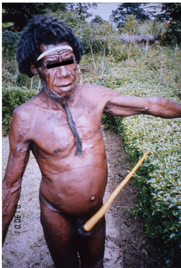
Figure 3 Subcutaneous cysticercosis patient in Papua. This patient was often attacked by epileptic seizures [41,43,58-63].

cysticerci was administered [92], this veiled asymptomatic NCC could not become symptomatic, and we could not find dual infections with T. saginata taeniasis and T. solium NCC. It is believed that T. saginata infections in people were due to consumption of undercooked beef “lawar” contaminated with cysticerci. In contrast, it is believed that the NCC case was due to accidental ingestion of T. solium eggs from a tapeworm carrier who had been infected in a T. solium endemic area of Bali.