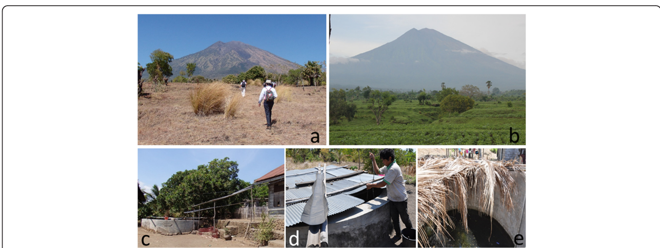
Figure 5 Landscape of the eastern slope of Mt. Agung (a, b) and water tanks for dry season (c, d, e). Dry season in September 2014 (a) and rainy season in January 2012 (b). Right half of the mountain (a): the eastern slope is completely brown. Southern slope in the left half is better in green, Western slope is completely green for all seasons (not shown).

NCC was discussed at two International meetings on “Recent Progress in Parasitology” (August 2007) and “Neurological Diseases” (November 2009) held in Denpasar. The meetings were aimed at both clinicians and medical researchers. These meetings were in addition to a symposium on cestode zoonoses in Asia which has been held almost every year since 2000 in Thailand, and in Japan (2006), and in Korea (2007) [39,60,64,68,72,73,76-78,89,98,99,110-112]. On 22 September 2014, a workshop focusing exclusively on the control of taeniasis and NCC was held at the University