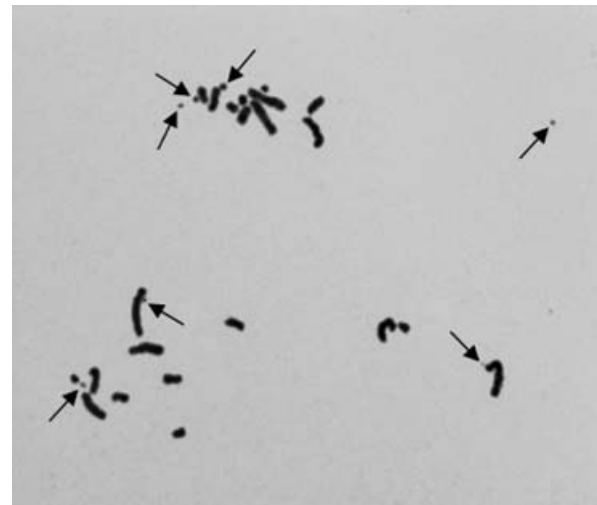
Figure 3 Multiple chromosome fragments (arrows) in the metaphase plate derived from dead Bryde's whale spermatozoa.

The rate at which hybrid zygotes were able to reach the first cleavage metaphase was 92.6% (63/68) in the motile sperm group, 82.5% (52/63) in the immotile sperm group and 87.7% (64/73) in the dead sperm group. All the metaphases in the immotile sperm groups were karyoanalysed, while one and four metaphases in the motile and dead sperm groups, respectively, were unsuitable for chromosome analysis owing to the underspread of chromosomes. As shown in Fig. 2, whale sperm chromosomes duplicated and well condensed within mouse ooplasm. The haploid chromosome number of the Bryde's whale was 22. They consisted of 18 metacentric, submetacentric or subtelocentric chromosomes and three acrocentric or telocentric chromosomes. The Y chromosome was the smallest one, and the X chromosome was regarded as a medium-sized metacentric chromosome. Table 2 shows the results of the chromosome analysis. Out of 62 hybrid zygotes in the motile sperm group, 59 (95.2%) had a normal chromosome complement, and two (3.2%) had a chromosome break and a chromatid exchange, respectively. On the other hand, the incidence of spermatozoa with a normal chromosome complement was significantly reduced to 63.5% in the immotile group and 50.0% in the dead group due to the remarkable increase of